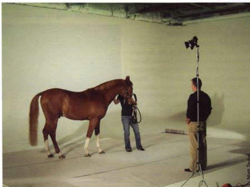
All in a days work. AVONDALE AMIR during filming.

Ben can now be seen on the commercial that has gone to air and will be featured on the packaging and advertising for PETstock branded horsey products.