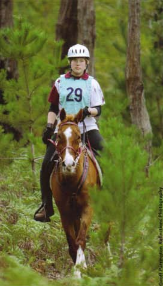
Geoff Parrington Reflections Photography